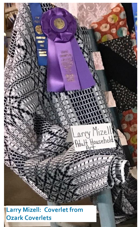
Larry Mizell: Coverlet from Ozark Coverlets