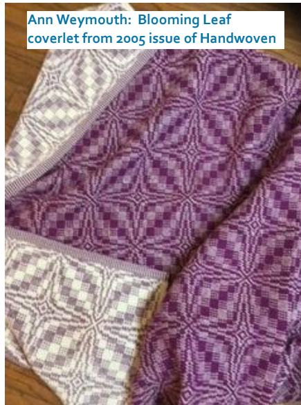
Ann Weymouth: Blooming Leaf coverlet from 2005 issue of Handwoven