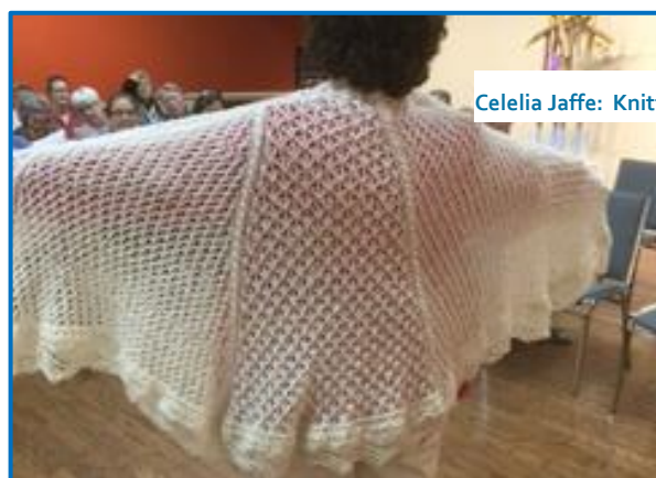
Celelia Jaffe: Knitted Shawl