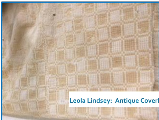
Leola Lindsey: Antique Coverlet