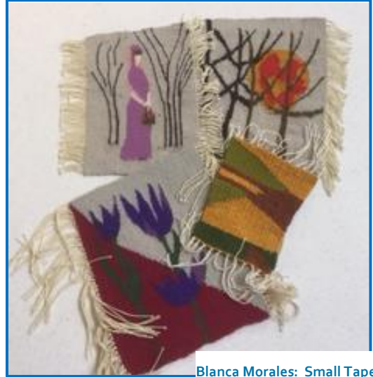
Blanca Morales: Small Tapestries